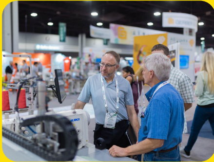
*Demographics from Texprocess Americas 2018 Survey